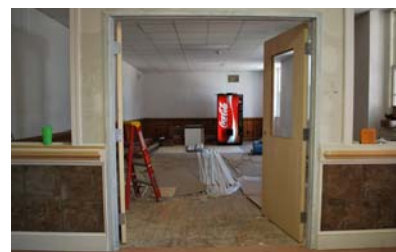
Students will return to numerous improvements in Wright Resident Hall.