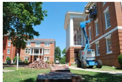
Residence Hall windows being restored.