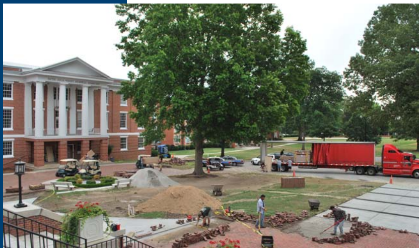
New doors being delivered as landscaping continues.

If you've been on campus this summer, you've probably noticed various construction and landscaping projects underway. Next month, we'll introduce a new section of the College website that will showcase "before-and-afters" and other photos following the progress. Stay tuned!